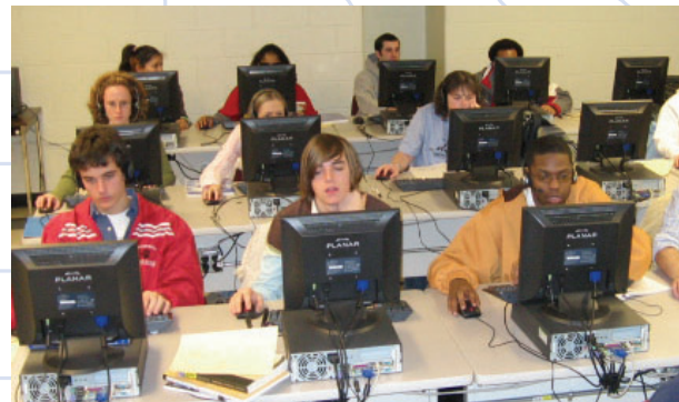
Make the most out of your language studies at our state-of-the-art language laboratory.

Foreign language majors who transfer credits from a foreign institution at the 300 or 400 level must take at least one 300 or 400 level course at FSU after they return and prior to graduation.