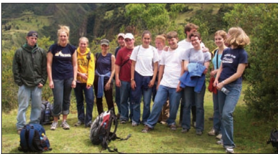
Study abroad, discover new places and make new friends like these FSU students did in Ecuador.