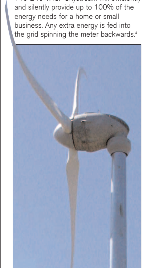
UL Certification and CE Certification Pending

Skystream is available on towers ranging from 35' (10.67m) to 110' (33.5m). 2 Its universal inverter will deliver power compatible with any utility grid from 110-240 VAC. 3 Skystream will efficiently and silently provide up to 100% of the energy needs for a home or small business. Any extra energy is fed into the grid spinning the meter backwards. 4