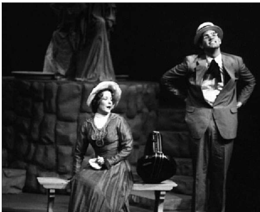
Scene from the recent University Theatre production of “Summer and Smoke.”

Students who want invaluable experience in media can take part in several extracurricular activities. Writers, editors, and artists/designers can join the staffs of two official student publications: (1) The Bottom Line , a student newspaper and (2) Bittersweet , a literary magazine. Students interested in broadcasting can work at WFWM, the campus radio station. FSU-TV transmits important campus information over Channel 3.