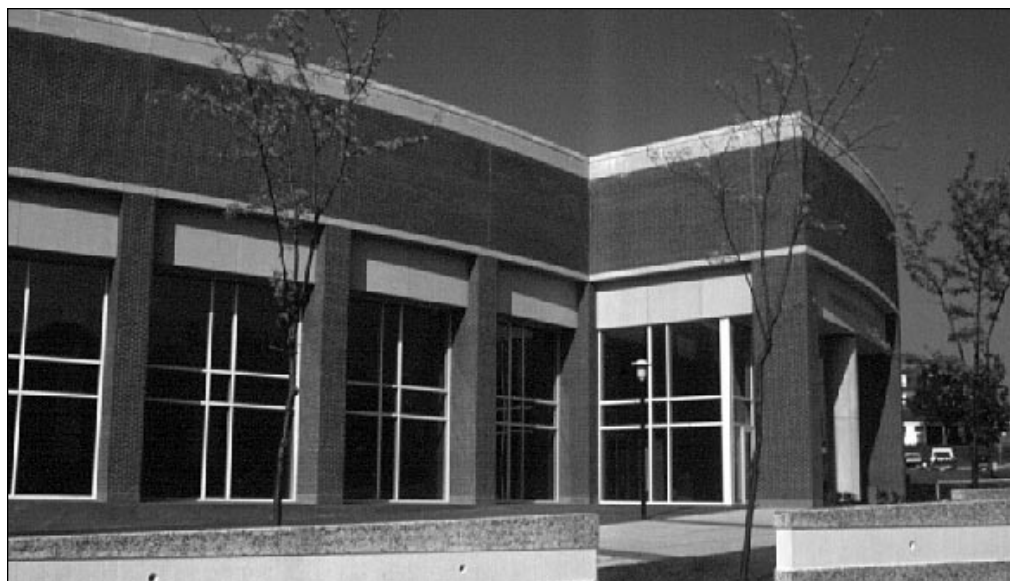
FSU's Performing Arts Center