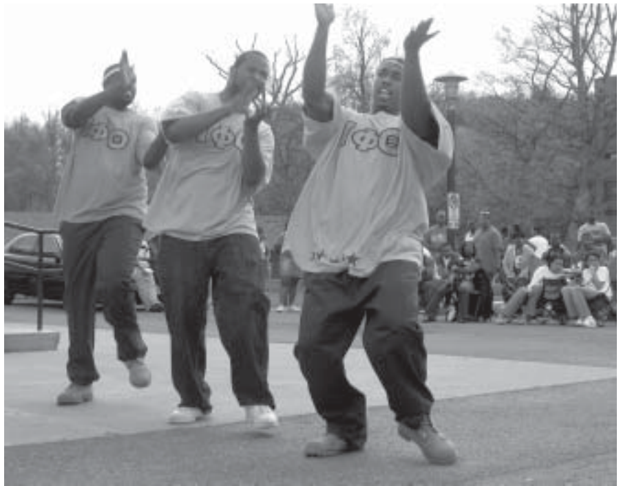
The Greek Step Show is one of the highlights of Homecoming Weekend.

Community Service Alpha Phi Omega Alternative Break Sierra Student Coalition