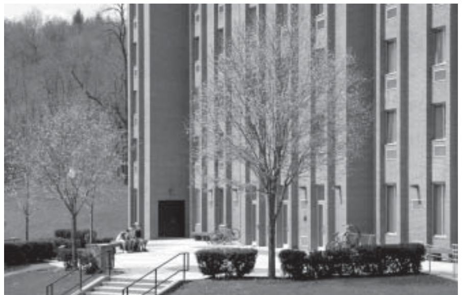
Westminster Residence Hall ►

Traditionally under-represented high school students from Maryland, Pennsylvania, and West Virginia are eligible for a program which helps them develop skills needed for entering and succeeding in post-secondary education—specifically in math and science. We offer a residential summer program at the University and academic year programs. For information and application, contact 301/687-4295 or this toll-free number: 1-800/646-6004.