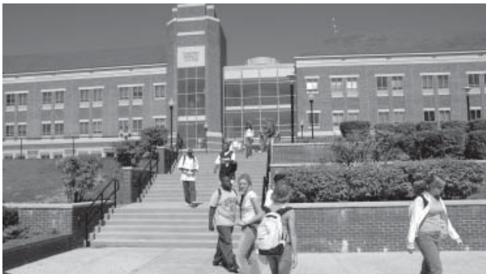
◀The new Compton Science Center