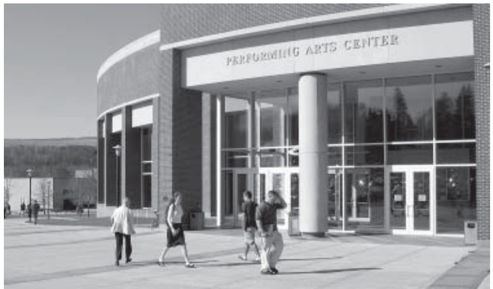
FSU's Performing Arts Center ▶

Students studying dance, music, theatre and communication can flourish in the Performing Arts Center. It contains three state-of-the-art theaters (Pealer Recital Hall, Drama Theater, Studio Theater), rehearsal spaces, music practice rooms and electronic labs, shops, offices, classrooms and facilities for the hearing-impaired. Campus and community audiences are welcome at a wealth of concerts and performances. For information, contact the Facilities Manager at 301/687-7460.