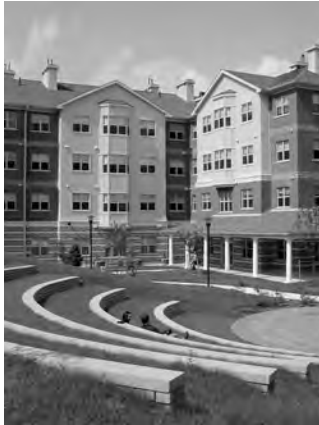
Edgewood Commons, FSU's new apartment-style residence hall.

Student involvement in distance education is encouraged and faculty are committed to providing the highest levels of academic support to our students for the distance learning opportunities on campus. For more information about distance learning, contact the Instructional Technology Support Center 301/687-4353.