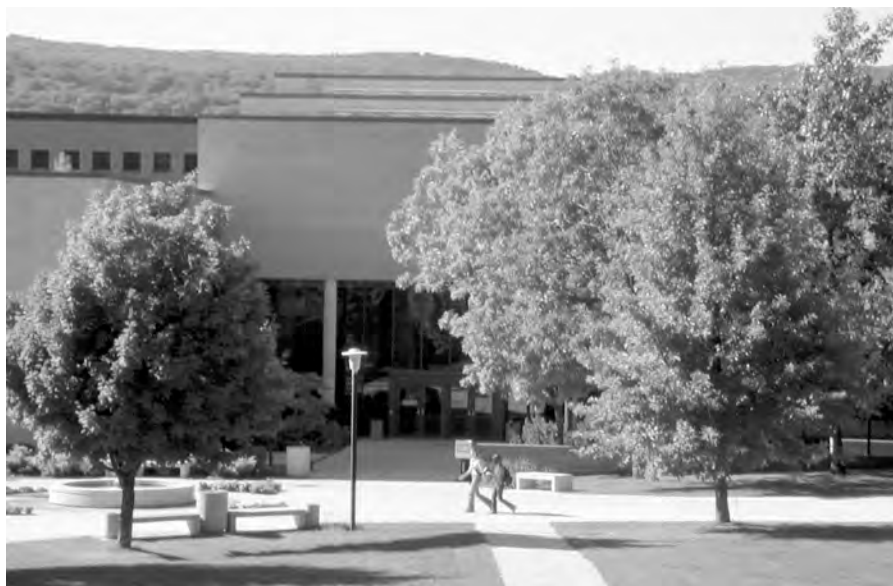
The Lane University Center, FSU's student union

FSU provides a fully licensed day-care center on campus for the children of faculty, staff, students and community residents. Children must be toilet-trained. For further information, contact the Children's Center at 301/687-4027.