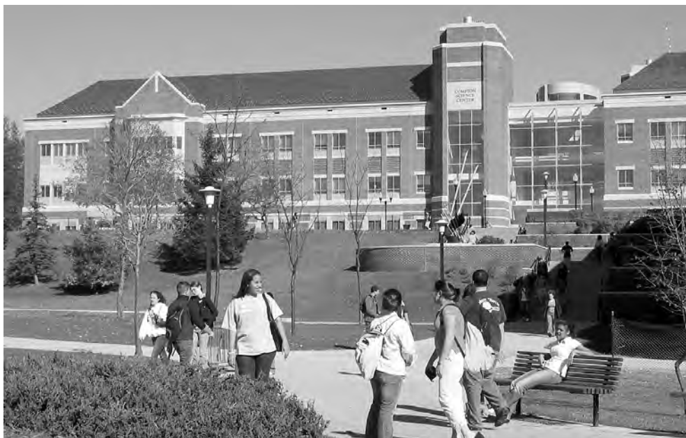
FSU's new Compton Science Center houses the departments of biology, chemistry, physics and engineering.

Students studying dance, music, theatre and communication can flourish in the Performing Arts Center. It contains three state-of-the-art theaters (Pealer Recital Hall, Drama Theater, Studio Theater), rehearsal spaces, music practice rooms and electronic labs, shops, offices, classrooms and facilities for the hearing-impaired. Campus and community audiences are welcome at a wealth of concerts and performances. For information, contact the Facilities Manager at 301/687-7460.