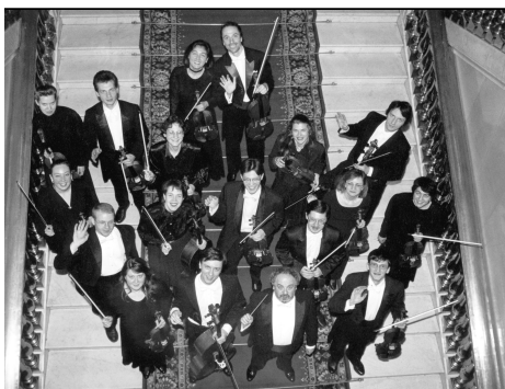
Chamber Orchestra Kremlin