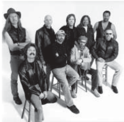
The Doobie Brothers

If sporting events aren't your style, check out the National Pan-Hellenic Council Step Show at 5:30 p.m. in the Alice R. Manicur Assembly Hall in the Lane University Center. The competition will showcase the many talented