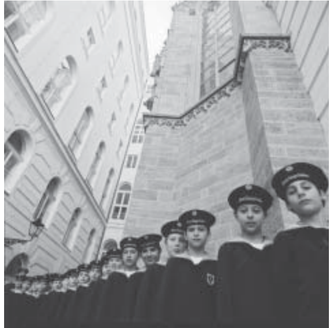
The Vienna Choir Boys

Today, there are around 100 choristers between the ages of 10 and 14, divided into four touring choirs. "Austria's