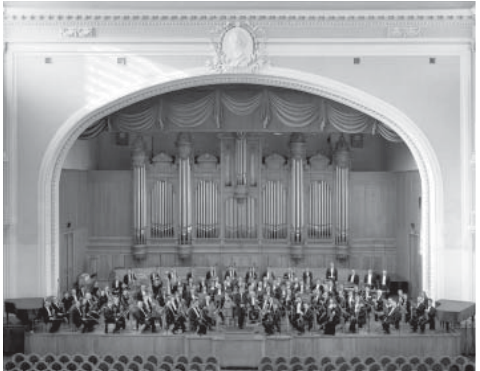
Moscow Symphony Orchestra

For more information on the performances listed above, contact the Department of Music at x4109.