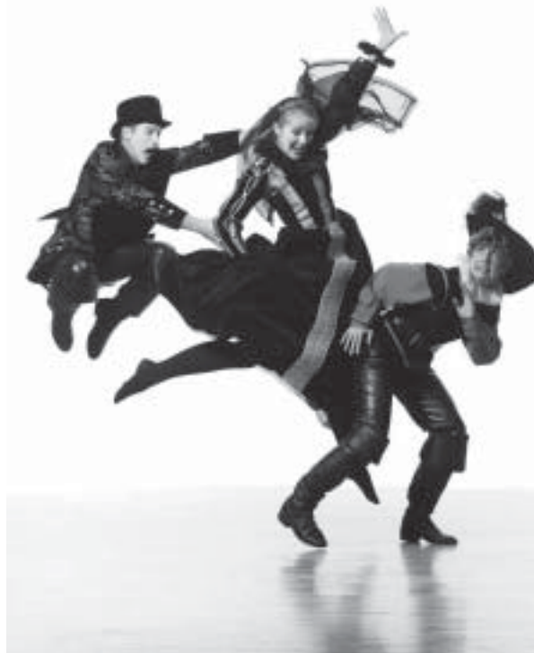
Aquila Theatre Company will perform William Shakespeare's "Romeo and Juliet" on Sunday, Nov. 5, at 7:30 p.m.

Long considered to be a highly talented British and American ensemble, Aquila Theatre Company brings to life the exquisite poetry, flamboyant characters and taut narrative of this tragic and timeless tale of unrequited passion. Aquila is known for its bold, intelligent and sparkling productions of Shakespeare and has received invitations to Shakespeare festivals around the world.