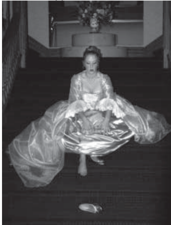
Cinderella is one of several characters who appear in "Into the Woods."

University Theatre's 2007-2008 season continues with several other exciting shows, including Beth Henley's quirky and dark comedy, "Abundance," Nov. 9, 10, 15, 16 and 17 at 7:30 p.m., with a matinee on Nov. 10 at 2 p.m. in