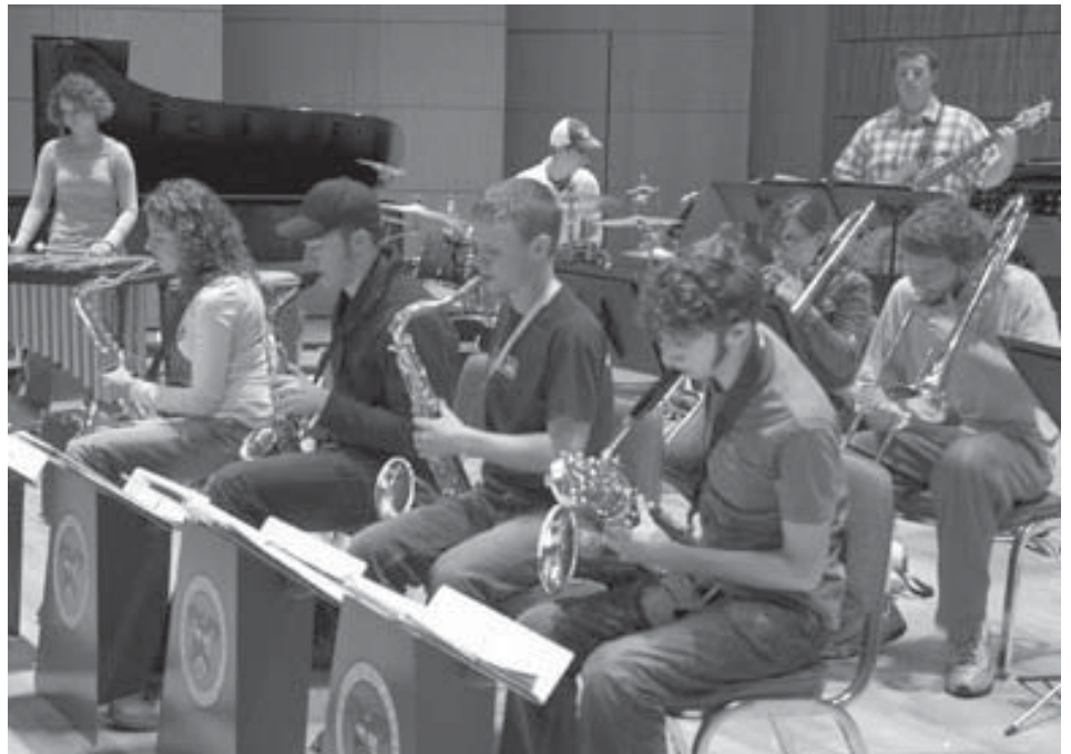
Faculty and students from the musical groups such as the Jazz Ensemble, above, and the FSU Opera Theatre, bottom left, will share their talents with the FSU community during several performances this week.

of music when the University Chorale, the Opera Theatre and the FSU Wind Ensemble present "A Musical Feast" at 3 p.m., Sunday, Nov. 18 , in the Performing Arts Center's Pealer Recital Hall. The concert will include a variety of selections that reflect the talents of each group.