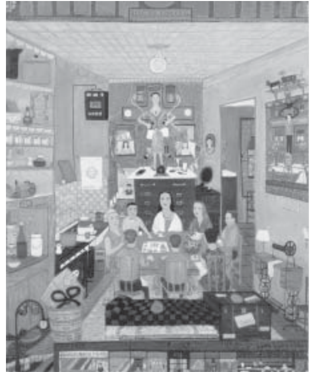
Above: A detail of a print titled "Family Supper" (1972) by Ralph Fasanella

Still looking for the perfect decorations to dress up your new pad? The Poster Sale continues from 10 a.m. to 5 p.m. Tuesday over in the Atkinson Room. Then head downtown to Frostburg's Main Street from 6 to 10 p.m. for the Frostburg Block Party , sponsored by the City of Frostburg, FSU, and Frostburg Business and Professional Association. Free shuttles from campus will be provided. Local businesses and campus departments will offer door prizes, information and food for sale. New this year: Block Party Battle of the Bands . Come out