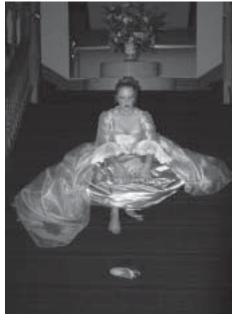
Cinderella, above, is one of several fairy tale characters who appear in "Into the Woods."

University Theatre's 2007-2008 season continues with several other exciting shows, including Beth Henley's quirky and dark comedy, "Abundance," Nov. 9, 10, 15, 16 and 17 at 7:30 p.m., with a