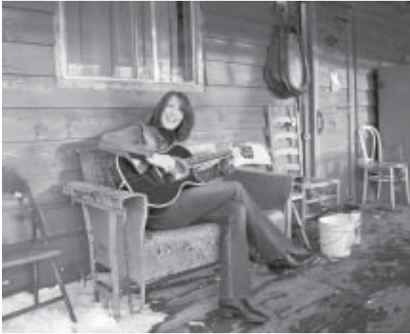
Grammy Award-winning artist Kathy Mattea, whose most recent CD is titled "Coal," will be one of the speakers for "Our People, Our Place, Our Coal" on Monday, Nov. 10.

As part of Grammy Award-winner Kathy Mattea's visit to Western Maryland, she and local experts will participate in "Our People, Our Place, Our Coal," a historical perspective presentation on Monday, Nov. 10 . This program will be presented by FSU Cultural Events Series and is free and open to the public. The presentation will run from 10-11:30 a.m. in the FSU