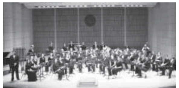
FSU Wind Ensemble