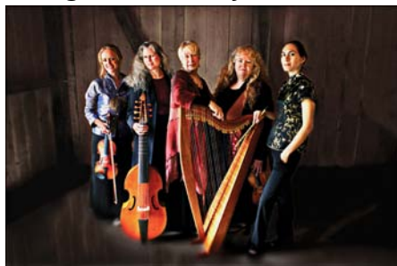
Ensemble Galilei, Sept. 13

The Best in Music, Theatre, Dance Coming to Western Maryland