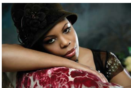
Regina Carter, Oct. 1

Tickets are available beginning at 9 a.m. on Monday, Aug. 24. Ticket packages and discounts are available, including the Build Your Own Series for those planning on attending several events throughout the year; Corporate Nights offering group pricing, priority seating and personalized service; and Group Sales with special rates for purchases of 15 or more tickets for a single performance. Tickets may be ordered by calling 1-866-849-9237 or 301-687-3137 or by visiting http://ces.frostburg.edu .