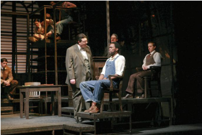
The courtroom scene from “To Kill a Mockingbird”