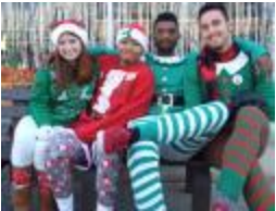
A few of Santa's elves posed for a photo at a previous Storybook Holiday.

This year, Storybook Holiday will be held on Saturday, Dec. 3 , in downtown Frostburg. To volunteer, visit the Children's Literature Centre web page at www.frostburg.edu/clc or the Facebook Page at www.facebook.com/clcfsu . For info, email clc@frostburg.edu or call 301-687-3133.