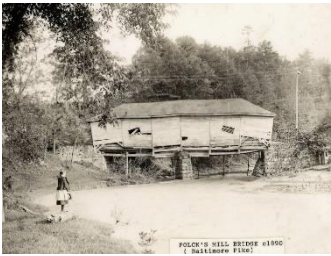
A photo of Folck's Mill Bridge from 1890

The Western Maryland Historical Library has collaborated with the FSU David M. Gillespie Special Collections to curate a digital exhibit of Allegany County historical bridge photographs from the Mel Collins Collection ( https://digital.whilbr.org/digital/collection/p16715coll67 ). Many of the bridges documented in the exhibit have been torn down. Learn about the Folck's Mill Bridge east of Cumberland, a battle site during the Civil War, the (two) "Blue" Bridges connecting Cumberland with Ridgeley, W.Va., various historic bridges along the Narrows and many others. The Mel Collins Collection consists of several thousand photographs and exhibit materials primarily related to historic