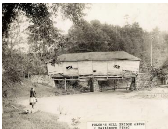
A photo of Folck’s Mill Bridge from 1890

The Western Maryland Historical Library has collaborated with the FSU David M. Gillespie Special Collections to curate a digital exhibit of Allegany County historical bridge photographs from the Mel Collins Collection ( https://digital.whilbr.org/digital/collection/p16715coll67 ). Many of the bridges documented in the exhibit have been torn down. Learn about the Folck’s Mill Bridge east of Cumberland, a battle site during the Civil War, the (two) “Blue” Bridges connecting Cumberland with Ridgeley, W.Va., various historic bridges along the Narrows and many others. The Mel Collins Collection consists of several thousand photographs and exhibit materials primarily related to historic