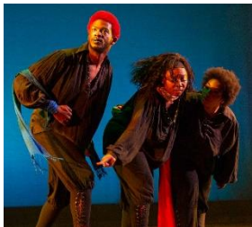
A scene from the 2022 Spring Dance Concert

FSU's Department of Theatre and Dance will hold auditions and interviews for fall 2023 incoming students on Saturday, Nov. 12 , from 10 a.m. to 1 p.m. (Auditions/interviews will also be held on Saturday, March 11, 2023 .) Auditions/interviews are required for the acting as well as design and technology tracks.