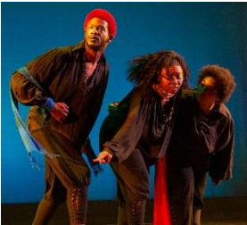
A scene from the 2022 Spring Dance Concert

FSU's Department of Theatre and Dance will hold auditions and interviews for fall 2023 incoming students on Saturday, Nov. 12 , from 10 a.m. to 1 p.m. (Auditions/interviews will also be held on Saturday, March 11, 2023 .) Auditions/interviews are required for the acting as well as design and technology tracks.