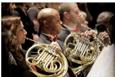
The MSO Orchestra

CES at FSU will present a concert of classical masterworks with the Maryland Symphony Orchestra on Friday, Nov. 11 , at 7:30 p.m.