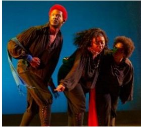
A scene from the 2022 Spring Dance Concert

FSU's Department of Theatre and Dance will hold auditions and interviews for fall 2023 incoming students on Saturday, Nov. 12 , from 10 a.m. to 1 p.m. (Auditions/interviews will also be held on Saturday, March 11, 2023 .) Auditions/interviews are required for the acting as well as design and technology tracks.