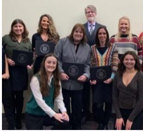
Participants pose at the NSLS ceremony.

On Dec. 4, the FSU chapter of the National Society of Leadership and Success held its fall semester induction ceremony and presented the Impact Leader Award to several faculty and staff members.