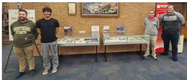
Students pose with one of the new exhibits.