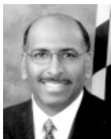
Lt. Gov. Michael Steele

is held annually to reflect on the human rights and human dignity issues for which Dr. King stood. It is also an opportunity for members of the University family to reaffirm the importance of securing equality for all and to reflect on the role that each of us can play in this effort.