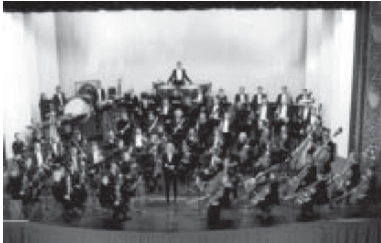
Maryland Symphony Orchestra

For tickets or more information, call the FSU Cultural Events Box Office at x3137 or toll free at 1-866-TIXX-CES, or visit online at ces.frostburg.edu.