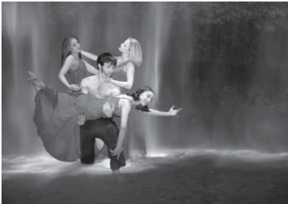
"Metamorphoses" retells some of the Roman poet Ovid's myths.

Tickets are $5 for students and $10 for the general public. For reservations and information, call x7462, Monday through Friday from 9 a.m. to 4 p.m.