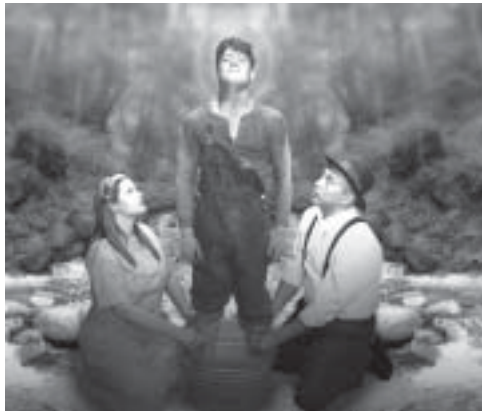
"The Diviners" takes place in a mythical town where water and faith are in short supply.