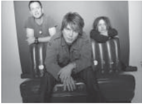
The Goo Goo Dolls

Tickets cost $65, $55 and $36, with $18 bleacher seats available to FSU students. For more information, call the Lane University Center Box Office Monday through Friday 9 a.m. to 3 p.m. at x3137 or toll-free at 1-866-TIXX-CES or online at http://ces.frostburg.edu .