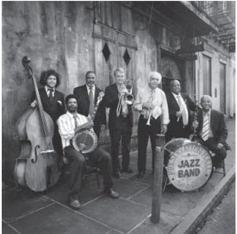
Preservation Hall Jazz Band

Once again, Goo Goo Dolls will support the USA Harvest organization along the tour by collecting food for distribution in each city, which in turn is distributed on the same night in every city they play. To date, the Goos