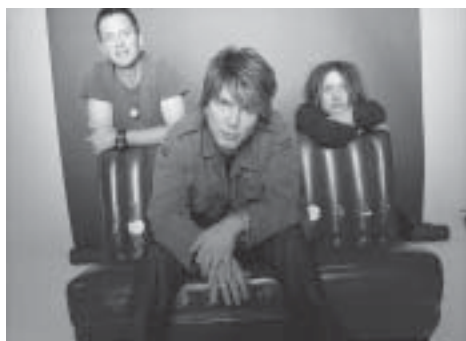
The Goo Goo Dolls

Tickets cost $65, $55 and $36, with $18 bleacher seats available to FSU students. For more information, call the Lane University Center Box Office Monday through Friday 9 a.m. to 3 p.m. at x3137 or toll-free at 1-866-TIXX-CES or online at http://ces.frostburg.edu .