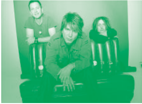
The Goo Goo Dolls

Best known for their chart-topping hits "Name," "Iris," "Slide" and "Here is Gone," the Goo Goo Dolls are on tour to promote their eighth album, "Let Love In," the result of a return to their Buffalo, N.Y., roots. Founding members John Rzeznik and Robby Takac left Buffalo for Los