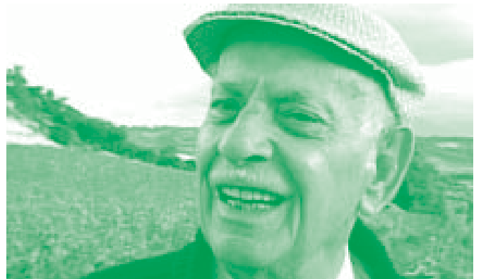
The film "Mondovino" focuses on the art of wine.