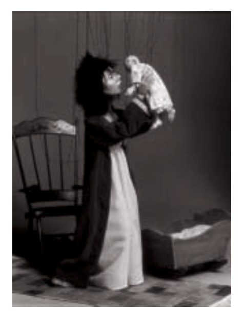
Puppets perform vignettes that explore different emotions in "Life in Motion."