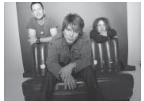
The Goo Goo Dolls

The alternative rock superstars the Goo Goo Dolls will appear in concert at FSU's Cordts Physical Education Center Main Arena on Sunday, April 22, at 8 p.m. Tickets are available at the FSU Lane University Center Box Office and online at http://ces.frostburg.edu .