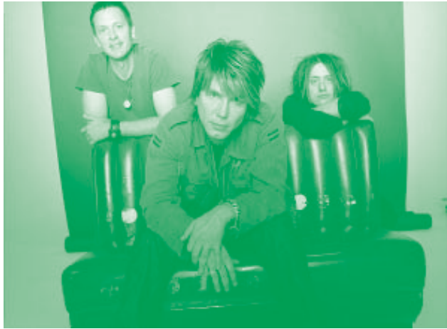
The Goo Goo Dolls