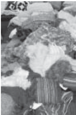
The sale of homemade scarves will benefit local women's shelters.

As part of its 2008 V-Day Campaign, FSU will have its annual Scarf Sale today through Feb. 15 in the Lane University Center and during the performances of "The Vagina Monologues." Proceeds will benefit both local centers.