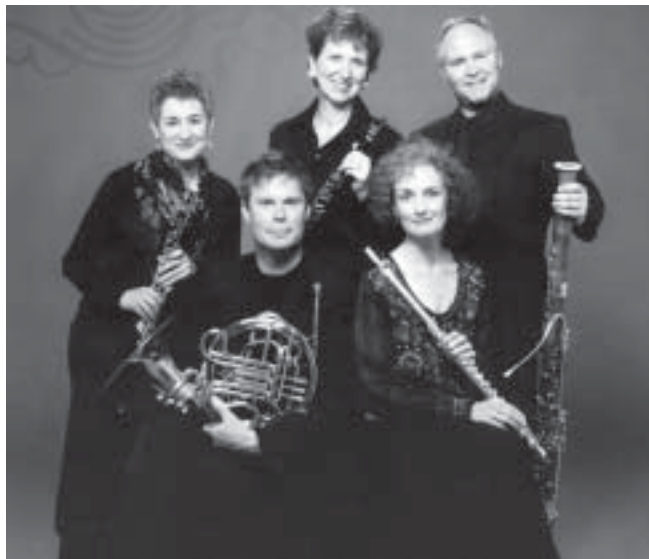
Check out the Borealis Wind Quintet at 7:30 p.m., Tuesday, April 1, in the Pealer Recital Hall.

The Borealis Wind Quintet has won numerous awards and prizes, including grants from the National Endowment for the Arts and Chamber Music America. The group was also nominated for a 2006