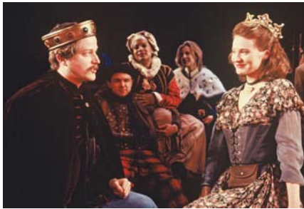
King Henry V meets Princess Katherine of France, the woman who will become his wife.

As the final event for the 2008-09 season, CES will present The Acting Company/Guthrie Theater Production of "Henry V" by William Shakespeare Tuesday, April 28 , at 7:30 p.m. in the PAC Drama Theatre.