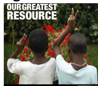
Pictured: Two survivors under the age of 9.