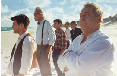
A Scene From “Journey to the Sea”

FSU will host the Fourth Annual Bridges to the World International Film Festival featuring films from Uruguay, Israel, Taiwan, Australia and the Czech Republic, in conjunction with the Office of Student Activities and Greek Life, International Division of Maryland’s Office of the Secretary of State and World Artists Experience.