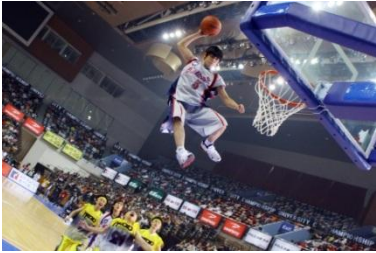
A Scene From “Kung Fu Dunk”

FSU continues the Fourth Annual Bridges to the World International Film Festival with a film from Taiwan, “Kung Fu Dunk,” on Tuesday, Feb. 26 , at 7 p.m. in Lane 111.