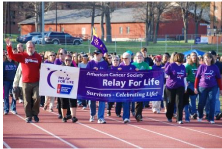
Participants in FSU’s Relay for Life, led by cancer survivors (in purple), make the first lap around the Bobcat Stadium track.

FSU’s annual Relay for Life, with a theme of Knock Cancer Out of the Park, broke its fundraising record again this year by raising $63,434.89. This makes a total of nearly $400,000 raised for the American Cancer Society since FSU’s relay began 12 years ago.