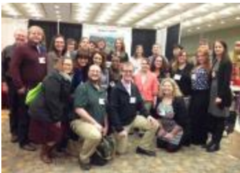
The FSU group at the MMEA In-Service Conference