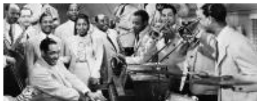
Duke Ellington with his orchestra