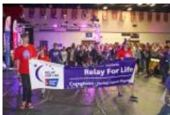
Caregivers for cancer patients take their lap during Frostburg State University’s American Cancer Society Relay for Life on April 29.

Cancer survivors, caregivers and supporters helped raised more than $37,500, passing a goal of $35,000, at the annual FSU Relay For Life held Friday, April 29, in FSU’s Cordts Physical Education Center.