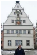
Brady Gaumer in Germany – Intersession 2019

FSU students have the opportunity to study abroad all over the world.