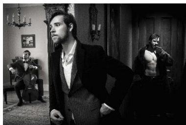
An untitled photo that appears in the exhibition

FSU's Department of Visual Arts will present "Self Not Selfie," a collection of photography by students from across the U.S., including Alaska, New York, Florida and Maryland, through Sunday, March 10 , in the Stephanie Ann Roper Gallery in FSU's Fine Arts Building. The exhibit is free and open to the public.