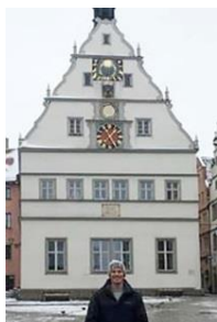
Brady Gaumer in Germany – Intersession 2019

FSU students have the opportunity to study abroad all over the world.